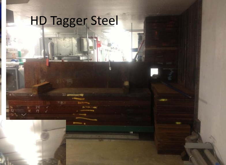
HD Tagger Steel